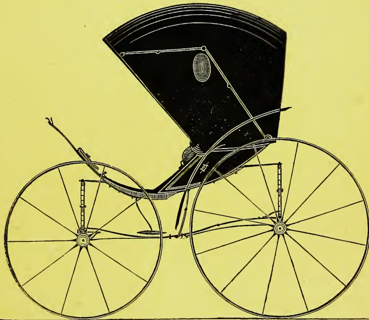
CLOSE-TOP PHYSICIAN'S PHAETON. — \frac{1}{2} IN. SCALE.

Designed and engraved expressly for the New York Coach-maker's Magazine.