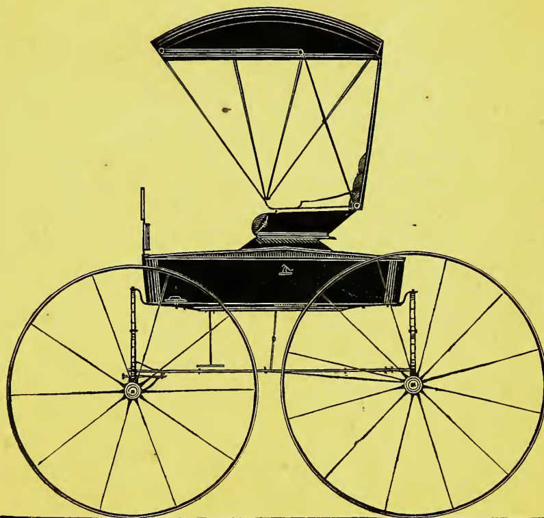
PIANO-BOX TOP WAGON. — \frac{1}{2} IN. SCALE.

Engraved expressly for the New York Coach-maker's Magazine.