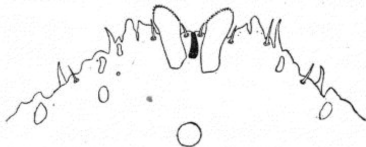
Diaspis townsendi , Ckll. From Silao.

Belongs to a little group consisting of D. townsendi , Ckll., D. toumeyi , Ckll., and D. fagrææ , Green, between Diaspis and Aulacaspis . The female resembles Aulacaspis , but the male scale is as in Diaspis .